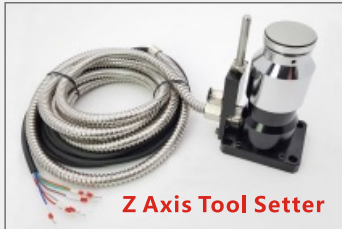
Z Axis Tool Setter