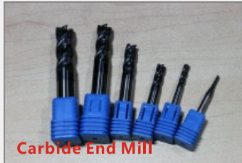
Carbide End Mill