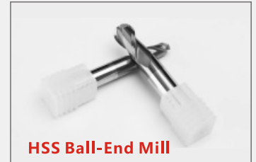
HSS Ball-End Mill