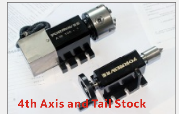
4th Axis and Tail Stock