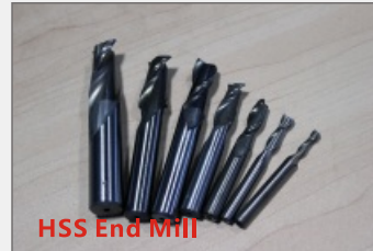
HSS End Mill